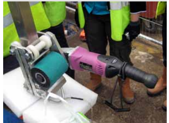
Figure 9: On-site polisher (“Rat up a drain-pipe”)

Information for this case study was kindly provided by Arup.