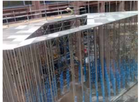
Figure 8: Pavilion under construction