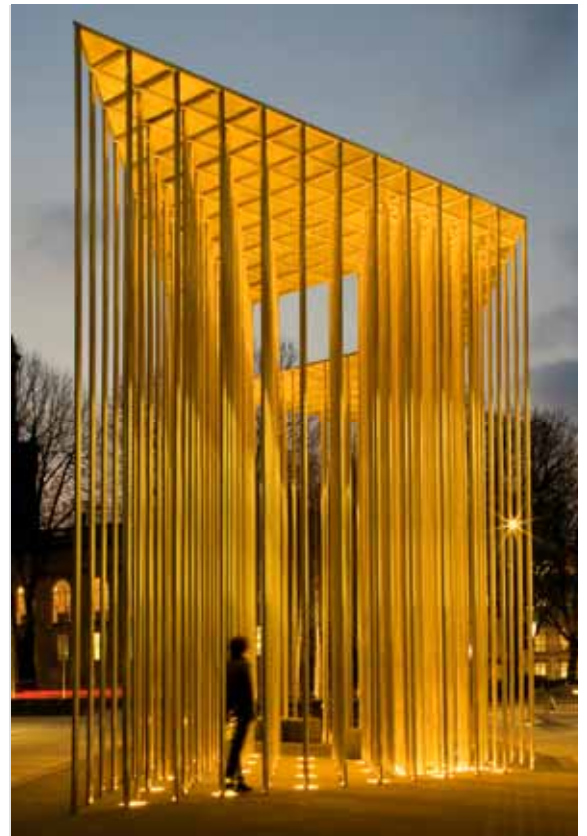
Figure 1: The Pavilion, Regent's Place, illuminated

The unusually high column slenderness was only possible by a design approach developed from first principles which involved establishing project-specific loading, deflection and acceleration criteria.