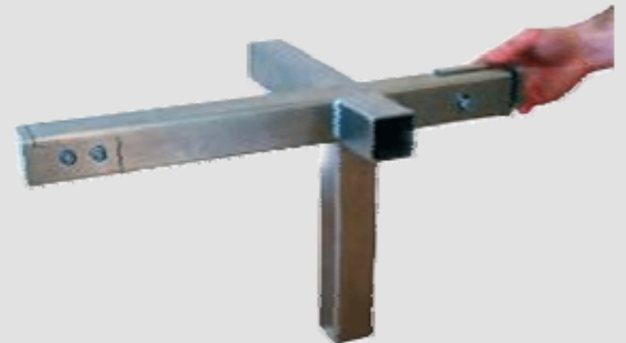
Figure 3: Mock-up of roof connection