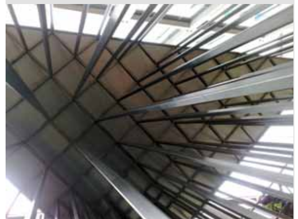
Figure 4: View of underside of roof