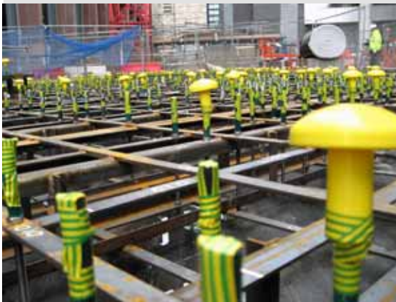
Figure 6: Bolt cage prior to concrete pour