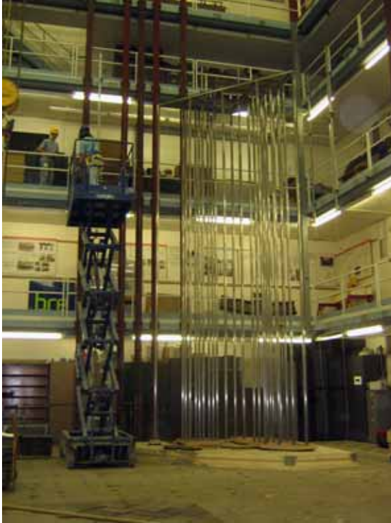
Figure 5: Mock-up of part of the pavilion at BRE